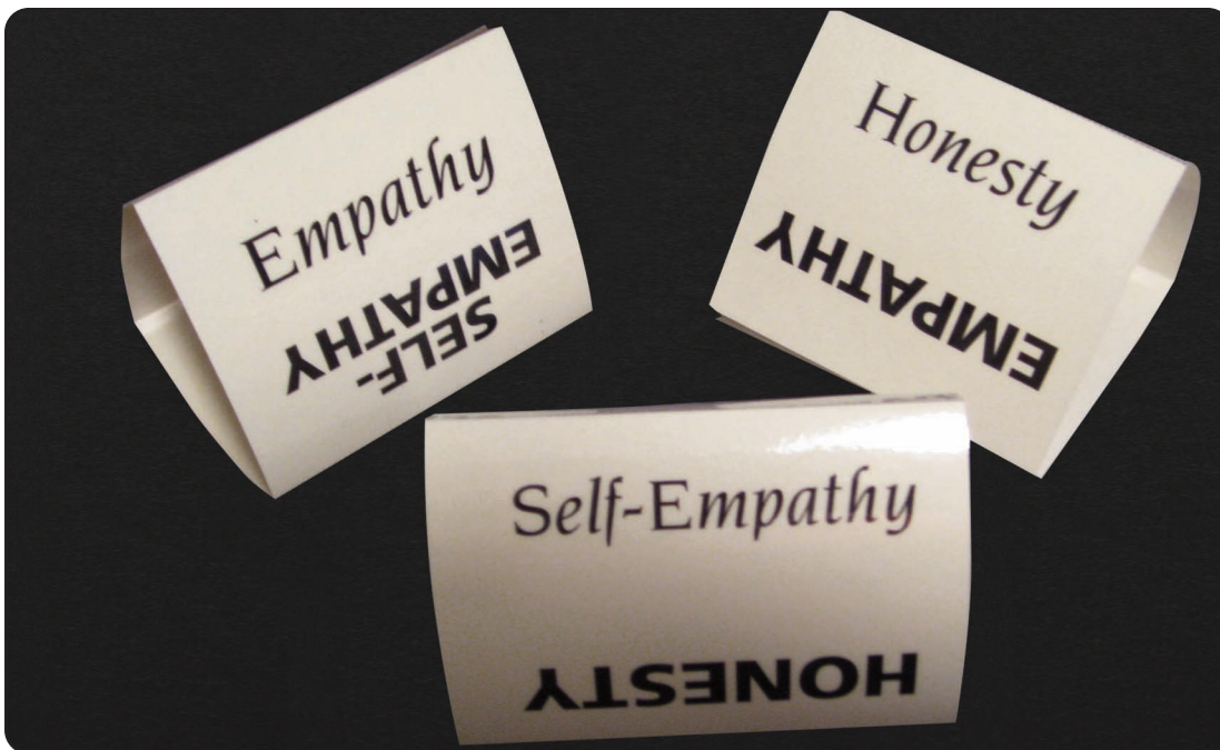
Three views of Tent Cards