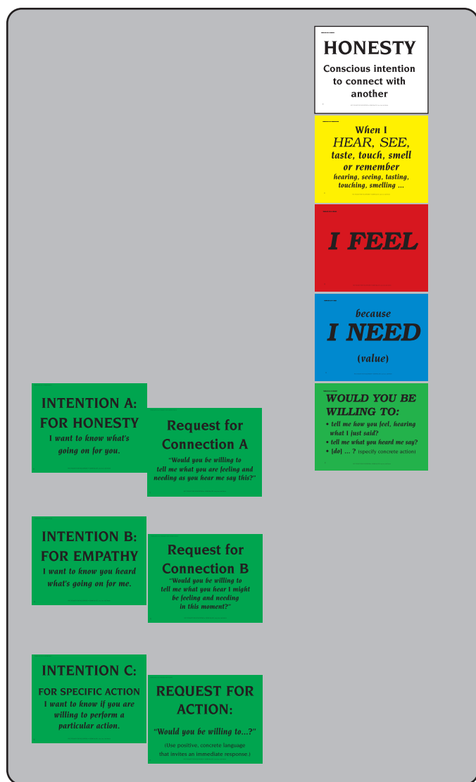
Six Steptones in relation to Honesty portion of Floor Map